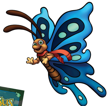
BOURNE THE BUTTERFLY