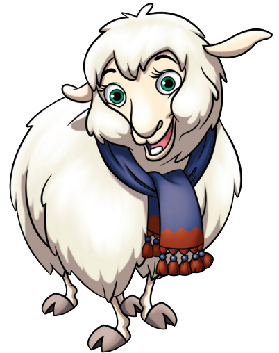
SHADOW THE SHEEP