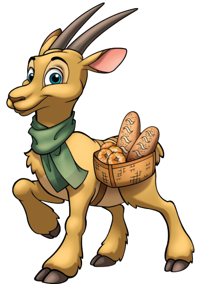
ABEL THE ORYX